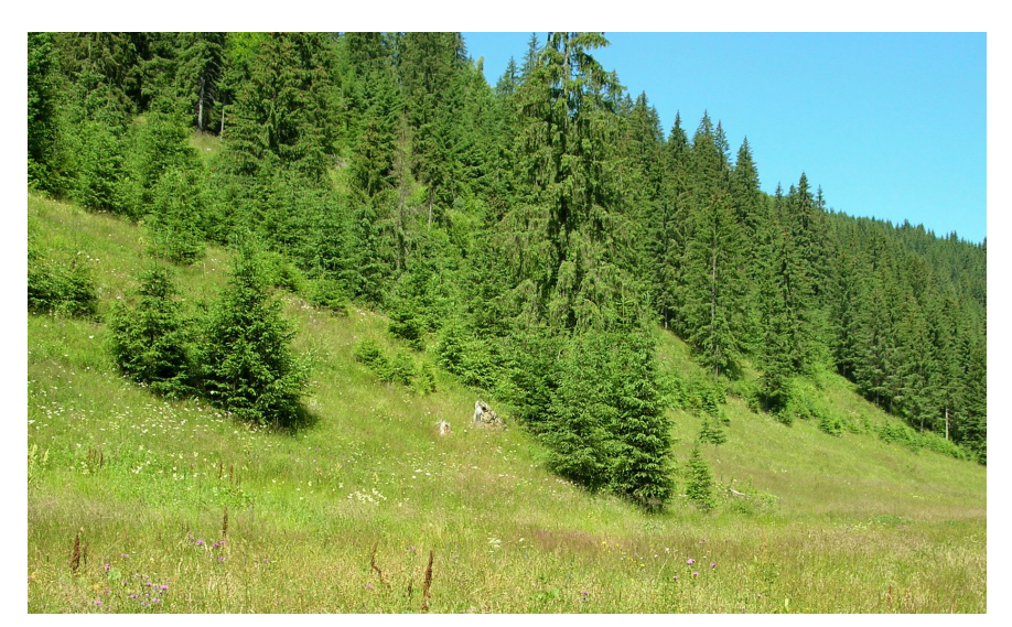
Fig. 5.– Habitat of Boloria titania transsylvanica , Romania, east of Gheorgheni, 20.vii.2006.