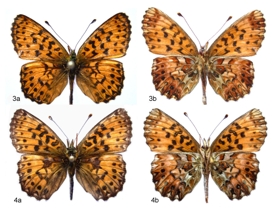
Figs. 3–4. Boloria titania transsylvanica , Romania, east of Gheorgheni, 20.vii.2006, leg. S. Cuvelier; 3.– male, 4.– female (a = upperside, b = underside).